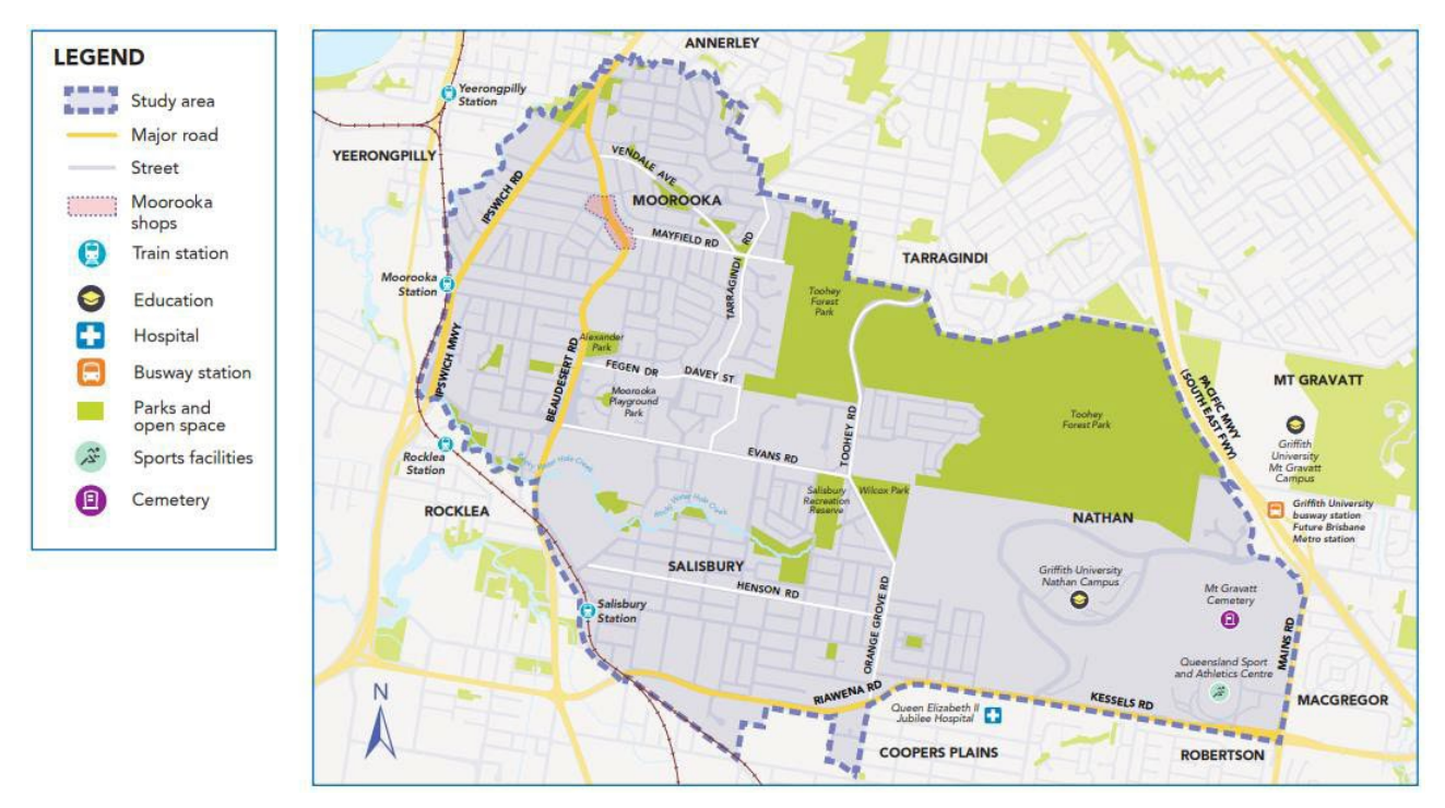
Figure 1 - Neighbourhood Plan area and boundary.